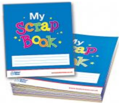
A scrap book