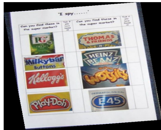
A treasure hunt: I-spy print